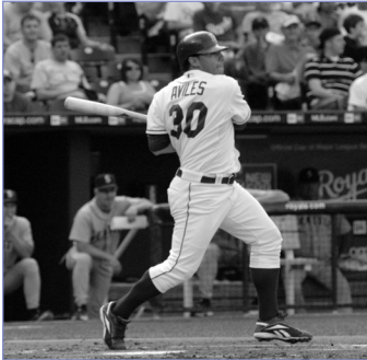
Mike Aviles hitting for the Kansas City Royals during the 2008 Major League Baseball season

While attending Concordia, Aviles, from Middletown, New York, starred at the Division II level, ranking at #1 in home runs per game, slugging percentage, and runs per game for the 2002 and 2003 seasons. The 2003 season marked the highlight of his college baseball career, as he batted .500 that season and was named "Division II Player of the Year". ■