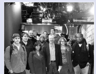
Concordia students pose with a stage manager and cameraman on the WNET-TV studio floor.