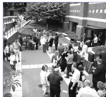
Join the Reunion crowd!

June 5-6, 2009 will be Reunion Weekend on campus for classes ending in "4" and "9". The weekend will begin with a reception on Friday evening, and continue Saturday afternoon with a family style BBQ and fun on the Quad!